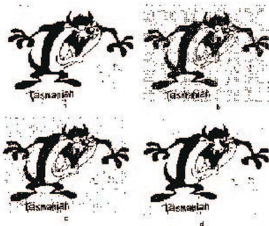
Figure 1: a) Original image; b) Image with noise; c) Result of the Gaussian filter; d) Result produced by CA